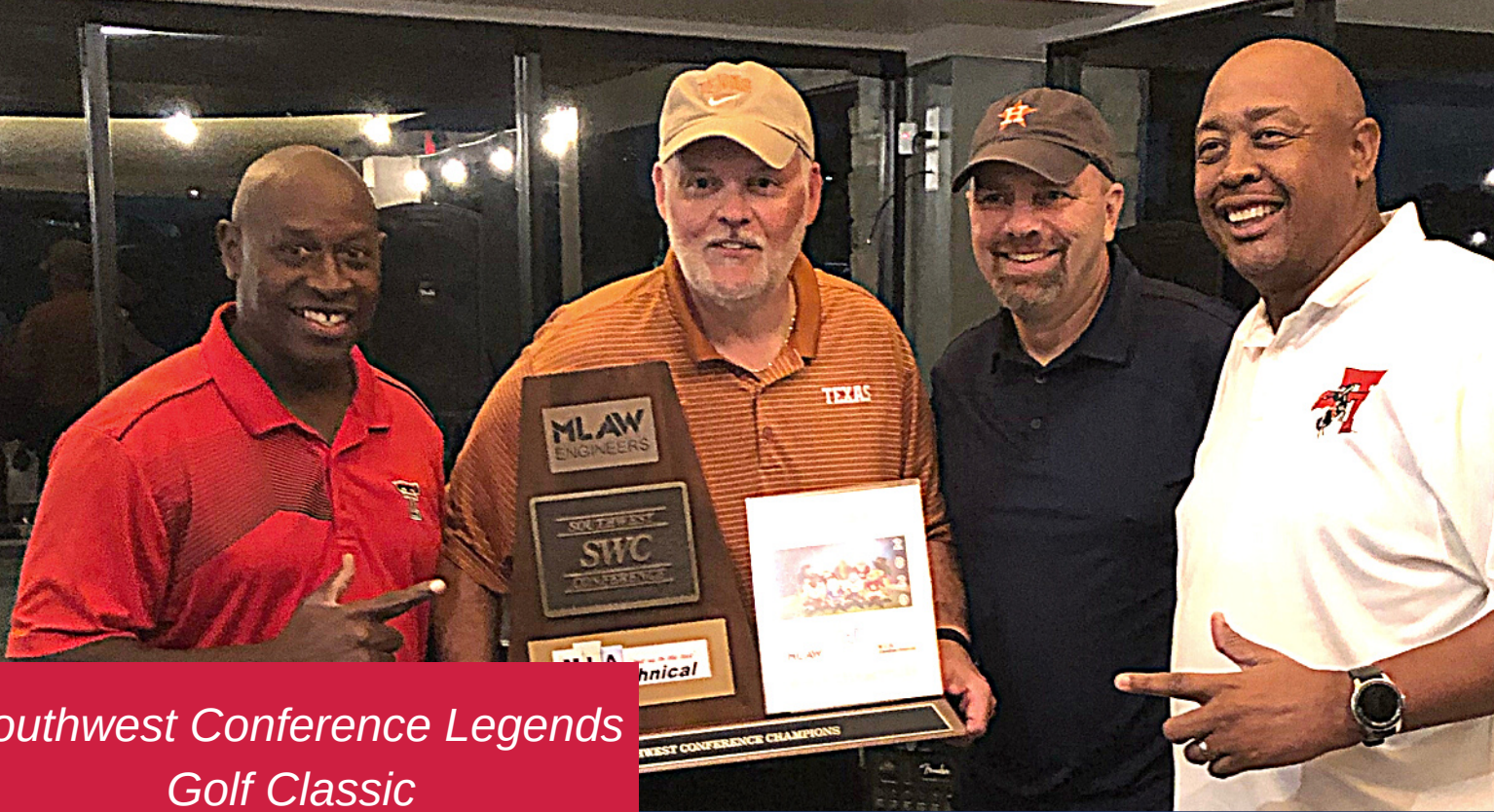
Southwest Conference Legends Golf Classic